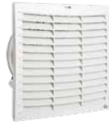
FPI 018 / FPO 018 up to 1010 m 3 /h (291 x 291 mm)