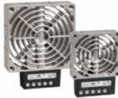
HV 031 / HVL 031 100 W - 400 W