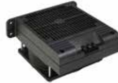
HVI 030 500 W - 700 W