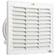
FPI 018 / FPO 018 up to 536 m 3 /h (223 x 223 mm)