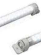
LED 021 (400 mm)