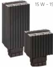
HG 140 15 W - 150 W