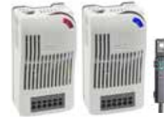
DCT 010 DC 20 - 56 V