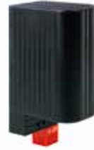
CSF 060 50 W - 150 W