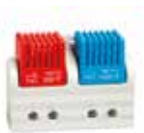
FTD 011 (NC / NO)