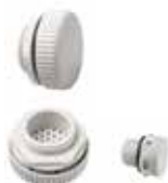
DA 284 (Plastic) IP66 / IP67