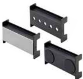
STEGOFIX PLUS SFP 095