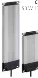
CP 061 50 W, 100 W, 120 W