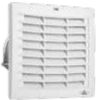
FPI 018 / FPO 018 up to 263 m 3 /h (176 x 176 mm)