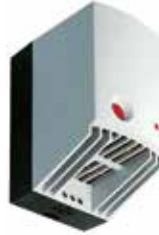
CR 027 up to 650 W