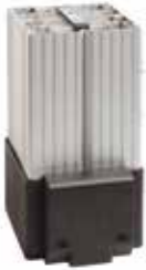
HGL 046 250 W - 400 W